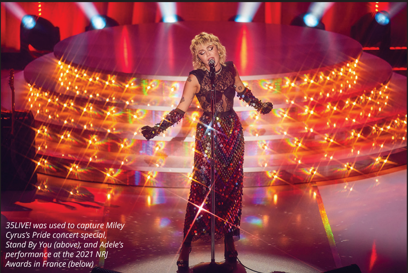
35LIVE! was used to capture Miley Cyrus's Pride concert special, Stand By You (above), and Adele's performance at the 2021 NRJ Awards in France (below)